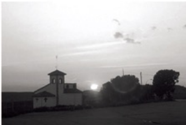
Hermitage in the service' s area el Ciervo

We go out to the N-II and catch her towards the left side crossing the village and after the last gas station to the kilometric point 390,5 we catch a way that leaves the national road to our left side, in the kilometric point 386,5 of the N-II we cross the road and continue the parallel way in another band, Hermitage of San Jorge.