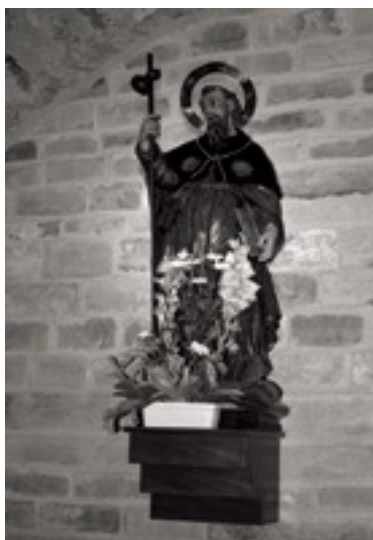
Sant Jaume's image in Pallerols

We go out for the side of the left side of the bus depots, next to a white hermitage we are a way cartwright without asfaltar we it will be necessary to continue a good moment . We will come to a way asphalted surface and will turn to the right without leaving the way that was taking us to Pallerols's locality.