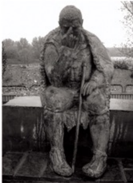
Sancho Panza Pensador's statue in Alcalá de Ebro

Where to be Informed: Town hall 976 616 275.