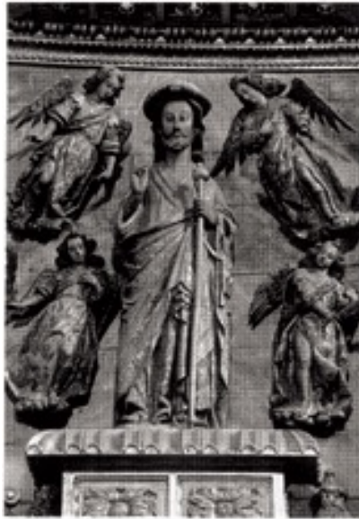
Image of Santiago of the church of Santiago the Real one

Police officer Tel. - 092. Station Bus. Tel.- 941235 983. RENFE. Tel.- 902 240 202.