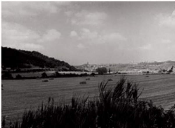
Cervera's panoramic sight

We turn to the left side for the Major street and continue it until one transforms into a way that not this one very clear and in poor condition continuing one dry river that it was taking to us to Fiol's fountain the cyclists we recommend to him to cross the whole village and to go out again to N-II and to continue it up to Cervera . From Fiol's fountain we continue the track up to Cervera .