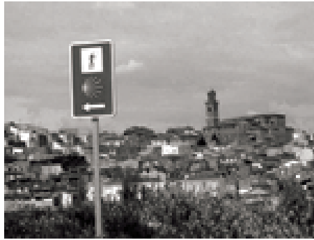
Image of the way of the Ebro for lands inhabitants of La Rioja

The second city of Navarre has titles of "very noble and very loyal" and is the capital of the region of the Bank. Your episcopal headquarters and your cathedral (s. The XIIth) are a patrimonial jewel of the city.