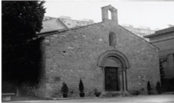
Church of Santa Eulalia de Provençana

Minero, Miquel Romeu ,Santiago de Compostela at this level there is 2 Km. Maestro Candi, Rodes, plaza Maestro Clave and to the right we leave the Third Gas station, avenue Fabregada, San Antoni, Pau Casals, Vigo, Ravine Rightly Oliveras we leave Enric Prat's street of the Riba to catch the Major street to go to the town hall to continue up to the street Famadas.