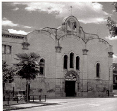
Sight of the Sanctuary of the Mare de Déu of the Pietat of Igualada.

The population of Pallerols visit and you were charmed with your church.