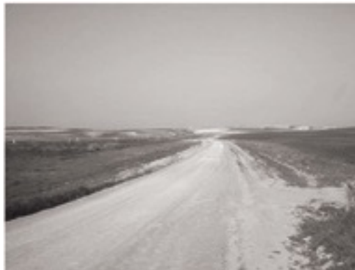
Way of the Ventorrillo

We have to continue the voyage of the road up to the kilometric point 434, cross with the road of Mequinenza to Huesca . We continue towards the right towards Huesca approximately 200 meters, pass a small bridge and to the left side, next to Grúas Cabos (street Monasterio de Sigena), catch the way for the Ravine of the Old Way that takes us to a few fields of fruits, olive groves and pines, on having gained the plateau. It is a long and hard ascension, which leaves to our backs the garden of Fraga and in front of us an immense plain that gets lost in the horizon.