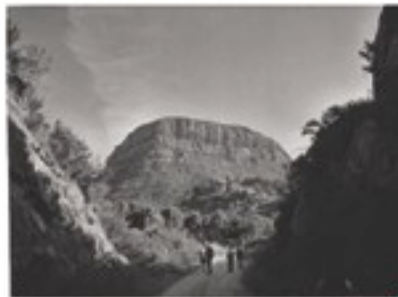
The famous cannon of colored

We will be still straight continuing the signs and parallel to the right the route of the railroad and to the left side the river Llobregat always iremos rectum to our right up to coming to the bridge of the air one here we have a Bar that according to that hour(o'clock) is we can catch victualling. The way was taking the population of Monistrol to us passing primeramente ahead from a filter system and at the level of the big bridge that the Llobregat crosses we will turn aside to the right to rise up to enter Monistrol the street of the Pla with the confluence of the Holy street Ana there we are a fountain we will continue the street and will turn to the left side to cross it bridge of the river and cogeremos the BP-1121 that after approximately 9 kms. will take us to the Monastery.