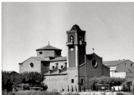
Panoramic sight of Sant Miquel's church Archangel of Bell-Lloc

To approximately 400 mts. We go out to a track to the left side that goes to the bridge on the highway and cross it. We continue for the right go for a track parallel to the highway half a km despues, in a bifurcation, continue to the left side. We cross for a bridge the routes of the train. We continue the same track, and enter Bell-lloc d ' Urgell.