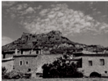
Castell of Jorba

We will find a fountain the this splendid water, will cross the village always continuing the signs and we will be still straight up to Jorba